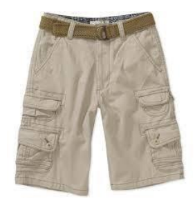
NO Cargo pants/shorts jean skirts