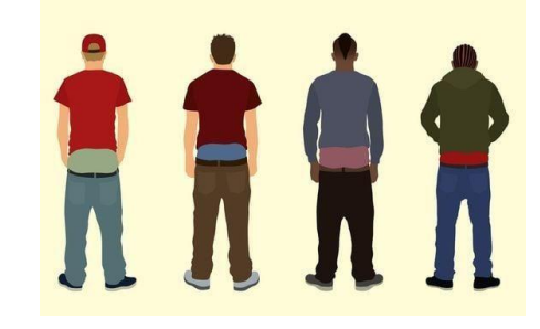
NO Saggy pants or underwear exposed